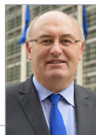
Phil Hogan, EU Commissioner for Agriculture and Rural Development

I strongly believe that financial instruments are a very useful tool for boosting investment in EU agriculture, creating growth and jobs. Through working with the EIB and EIF, we are expanding our outreach, and this specific EIF Agri guarantee facility is a good example of how we can offer EAFRD Managing Authorities a fully-fledged and well-tested instrument, with which they can respond to farmers' investment needs, including young farmers.