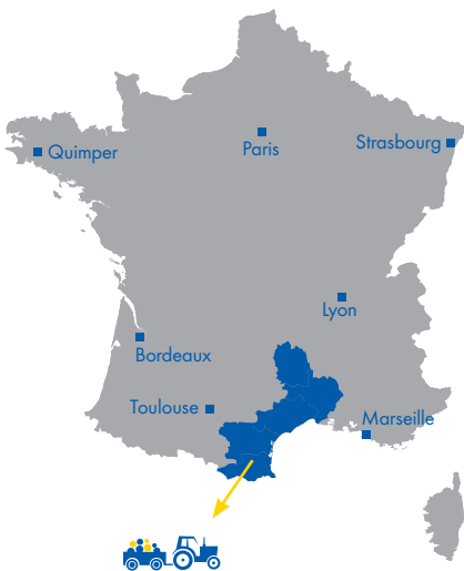
Agriculture represents the 2nd most important economic sector in Languedoc-Roussillon

The European Agricultural Fund for Rural Development (EAFRD) is one of the five ESIF and is implemented under shared management with decisions taken by Member States. In 2014-2020, its total volume reaches almost EUR 100bn . The majority of the EAFRD investment volume is programmed for agriculture (about EUR 23bn ), followed by investments in rural micro- and small businesses and farm diversification ( EUR 7.5bn ), rural services and infrastructure ( EUR 6.6bn ), and forestry ( EUR 4.6bn ). A small proportion of these resources used in the form of financial instruments, such as the EIF's AGRI guarantee, could generate enormous financial and growth potential for the area concerned. It could unlock access to funding for many businesses in agriculture and new non-agricultural activities.